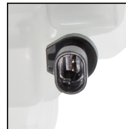
Coolant Level Sensor